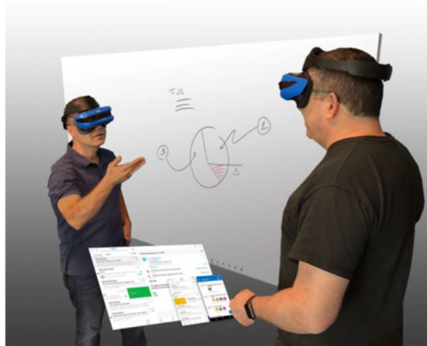
Figure 4. Private displayed content could support conversations, in particular for people challenged with social interaction.

Text entry and document editing is an important and common task of today's office work, yet many other tasks could potentially benefit from the VR medium. For example, meetings can be independent of distances, travel time, and availability of meeting rooms and their instrumentation. Conversations, recorded by wearable microphones are easier to transcribe and translate, people, objects, and social happenings in virtual spaces can be easier to analyze and describe to people who cannot visually observe the meeting room. Conversations may be mediated to include relevant information or help people challenged in social situations by using the private display of each participant 11 and more (see Figure 4).