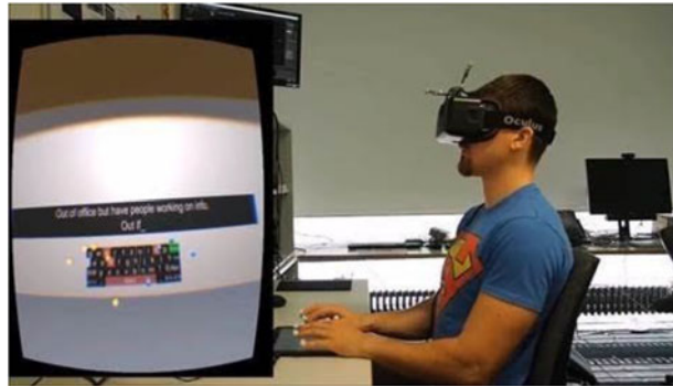
Figure 2. Displaying the user's hands in the view direction, rather than at the natural position has the potential to help the user remain focused on the document. It also has little to no impact on typing performance when using a traditional keyboard.

fingertips), see Figure 2. While this eliminates the need to constantly shift attention between the keyboard and document, it may also require the users to reposition their hands while typing. While such repositioning of the keyboards and hands proved to have little impact on typing efficiency with a physical keyboard, it resulted in some degradation of performance on touchscreen keyboards (perhaps due to the change of the direction of the finger motion as they disconnect from the touch surface).