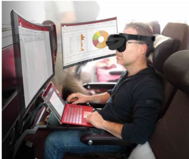
Figure 1. A virtual office environment in VR. A user may enjoy a large multidisplay environment and background disturbance reduction, even in challenging environments.

Many times, the physical environments surrounding users are clearly suboptimal. The available physical, as well as display space, might be small, and illumination may be less than adequate, resulting in a slew of disturbances all around users. An extreme example might be a person trying to work while sitting in an economy seat on an airplane (Figure 1).