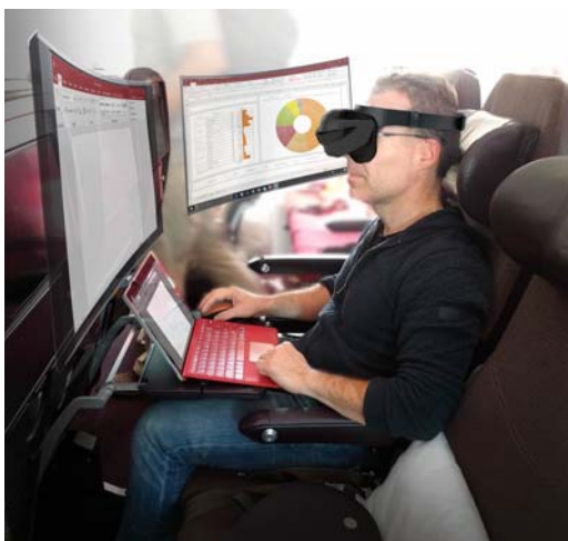
Figure 2: A vision of the future mobile information worker. The user can benefit from typing abilities provided by a laptop or tablet and VR provides an immersive virtual multi-display environment.

While transplanting standard keyboards to VR is viable, there are design parameters that are currently still unknown that can plausibly affect performance. First, the performance differential and skill transfer afforded by a desktop keyboard or touchscreen keyboard in VR is not well-understood. While both techniques benefit from being familiar to users, they also provide certain advantages and disadvantages. A desktop keyboard provides tactile sensation feedback of the keys to the user, thereby potentially lessening the importance of visually conveying the location of the user's fingertips in relation to the keyboard in the VR scene. On the other hand, touchscreen keyboard input carried out via a tablet allow for a user interface that can be easily reconfigured and support additional user