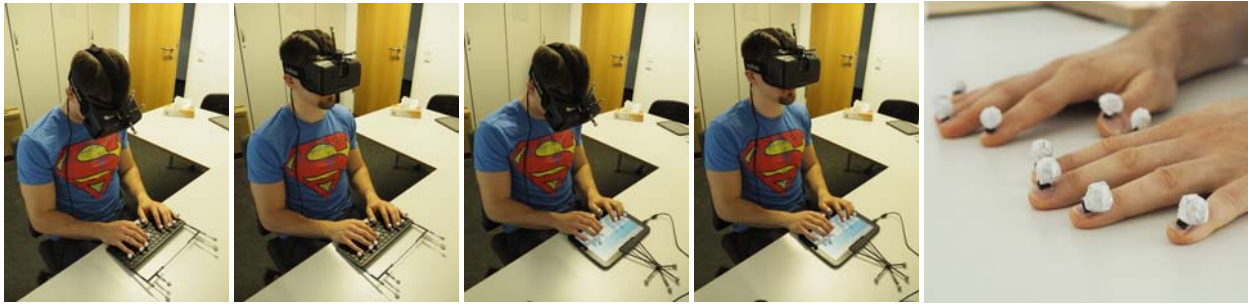
Figure 3: From left to right: external views on the conditions DESKTOPKEYBOARD+NoREPOSITION , DESKTOPKEYBOARD+REPOSITION , TOUCHSCREENKEYBOARD+NoREPOSITION , TOUCHSCREENKEYBOARD+REPOSITION , retroreflective markers used for tracking fingers.

Prior work has investigated a variety of wearable gloves, where touching between the hand fingers may represent different characters or words, e.g., [3, 12, 17, 24]. Such devices enable a mobile, eyes-free text entry. However, most of them require a considerable learning effort, and may limit the user ability to use other input devices while interacting in VR, such as game controllers.