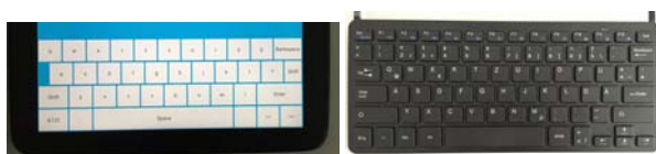
Figure 4: Keyboards used in the experiment. Left: touchscreen keyboard, Right: desktop keyboard.

The calibration phase consisted of three parts: text entry profiling, interpupillary distance (IPD) calibration and finger tip calibration. In the text entry profiling phase, participants were asked to copy prompted sentences using two de-facto standard text entry methods: a desktop keyboard and a QWERTZ touchscreen keyboard. Stimulus phrases were shown to the participants one at a time and were kept visible throughout the typing task. Participants were asked to type them as quickly and as accurately as possible. They typed stimulus phrases for 3 min using a desktop keyboard and, after a short break, 3 min using a QWERTZ touchscreen keyboard. The order of the text entry methods was balanced across participants. The interpupillary distance (IPD) was determined using the Oculus